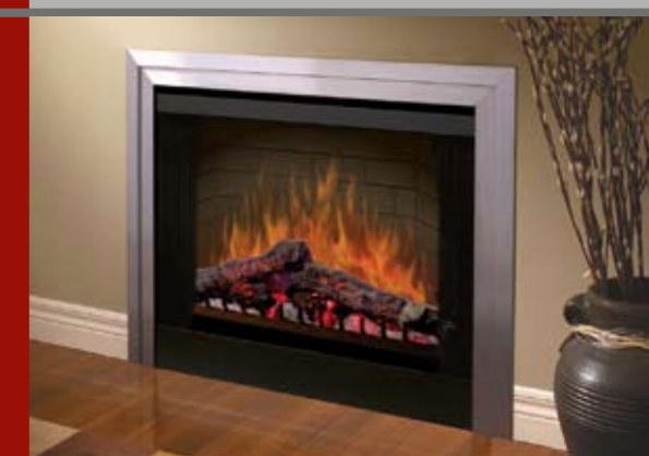
Shown with optional decorative surround trim (BF4TRIM33SS) and optional glass door (BFDOOR33BLKSM)