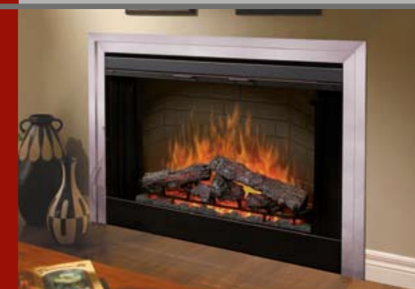
Shown with optional decorative surround trim (BFKIT45SS) and optional glass door (BFDOOR45BLKSM)