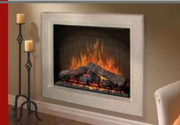
Shown with optional decorative stone trim (BS39-STN) and optional glass door (BF39DOOR39BLKSM)