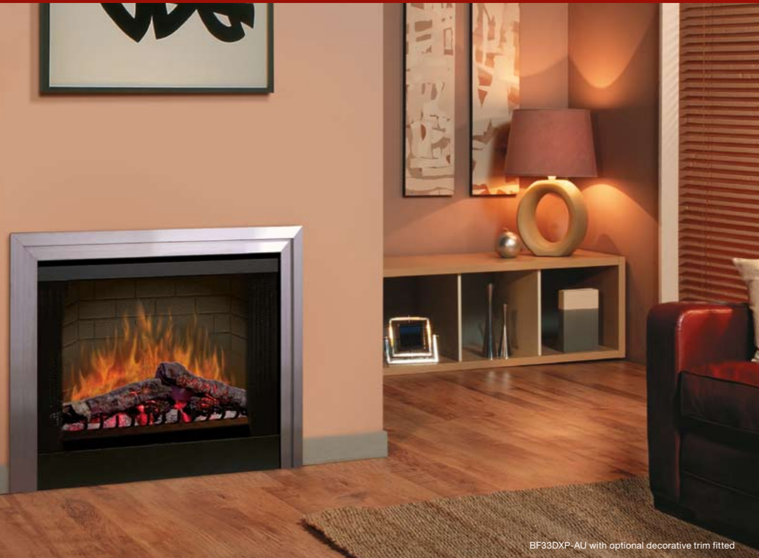
BF33DXP-AU with optional decorative trim fitted

The safe and easy-to-install alternative to gas and wood burning fireplaces that looks so REAL